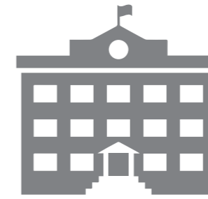
Small and Medium Meeting Rooms